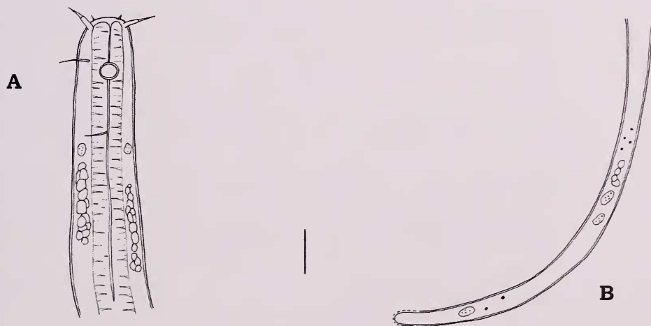
Figure 2.- Trefusia aff. pseudolitoralis . Juvenile. A. Anterior end. B. Posterior end. Scale = 15 \mu m.